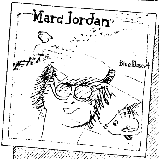
"BLUE DESERT" MARC JORDAN